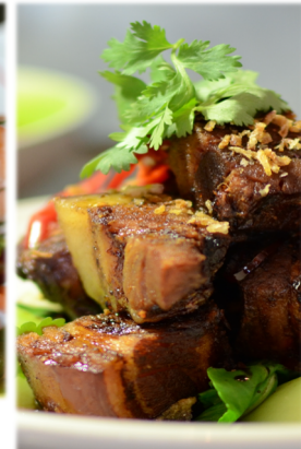
Taste of the Oriental